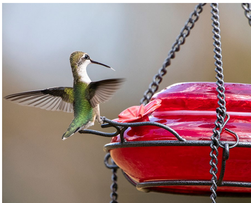
A female ruby-throated hummingbird feeding on a supplemental feeder

To create the sugar water solution combine 1 part refined white sugar with 4 parts of boiling water until all the sugar has dissolve. Let the solution cool to room temperature before adding it to the feeder. Excess sugar solution can be stored in the fridge.