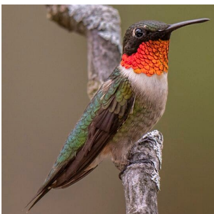
Adult male Ruby-throated hummingbird. Only the males have the bright red throat.

https://www.greenwoodnursery.com/orange-trumpet-creeper