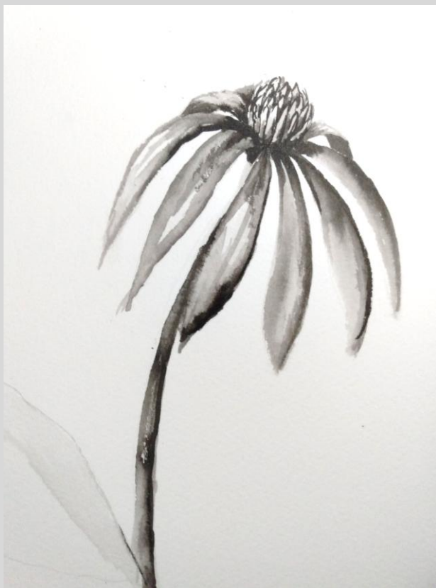
Monochromatic ink wash