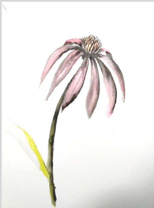
First glazes of color