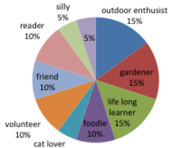
An example of an identity pie chart